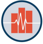
FIGURE 3: FACILITY CLAIMS PROCESS, OUTPATIENT